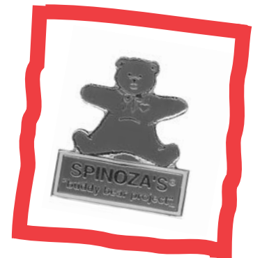
Left: Spinoza, Poppy Bear™, and Stymie the Skunk™ Hand Puppets. Above: Spinoza's "buddy bear project" Lapel Pin (Actual pin size shown)

Spinoza®...the Bear Who Speaks from the Heart™ has been a trusted companion and a source of joy and comfort to thousands of children who suffer from profound crises in their lives. Organizations who sponsor children through the project have come up with many innovative ideas on how to raise funds to provide this special gift.