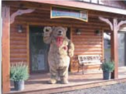
"Hello!", from Spinoza's new home in the "Great North Woods"